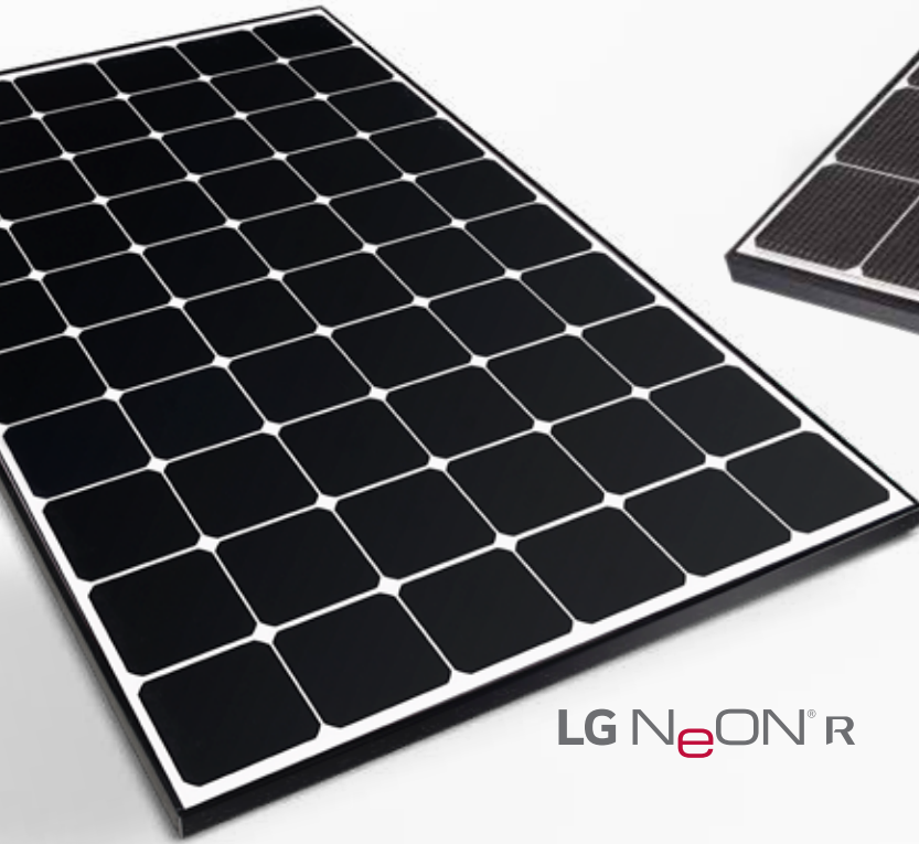
LG NeON ® R