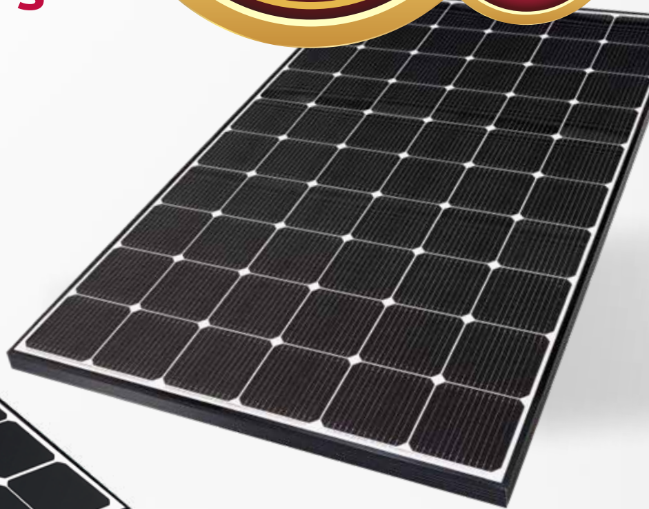
LG NeON ® 2